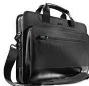
ThinkPad Ultraportable Case (41U5062) ThinkPad Executive Leather Case (43R2480)