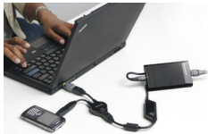
Lenovo 90W Ultra-slim AC/DC Combo Adapter (41R4493)