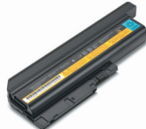
ThinkPad Battery 29 3-cell (0A36281) ThinkPad Battery 29+ 6-cell (0A36282) ThinkPad Battery 29++ 9-cell (0A36283)