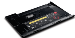
ThinkPad Battery 19+ 6-cell Slim External (0A36280)