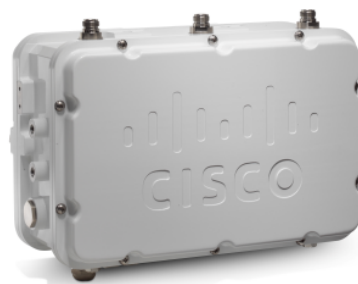
Figure 1. Cisco Aironet 1520 Series

The Cisco Aironet 1520 Series supports dual-band radios compliant with IEEE 802.11a and 802.11b/g standards. Various uplink connectivity options are supported such as Gigabit Ethernet (1000BaseT), and small form-factor pluggable (SFP) slot for fiber (100BaseBX) or cable modem interface. Power options supported includes 480VAC, 12VDC, cable power, Power over Ethernet (POE), and internal battery backup power. It also employs Cisco's Adaptive Wireless Path Protocol (AWPP) to form a dynamic wireless mesh network between remote access points, while delivering secure, high-capacity wireless access to any Wi-Fi-compliant client device (Figure 2).